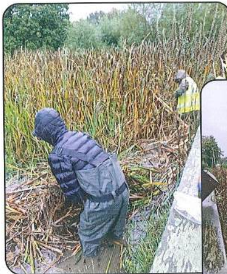
One of the Wednesday pond clearance sessions - it was a really wet day, from above and below