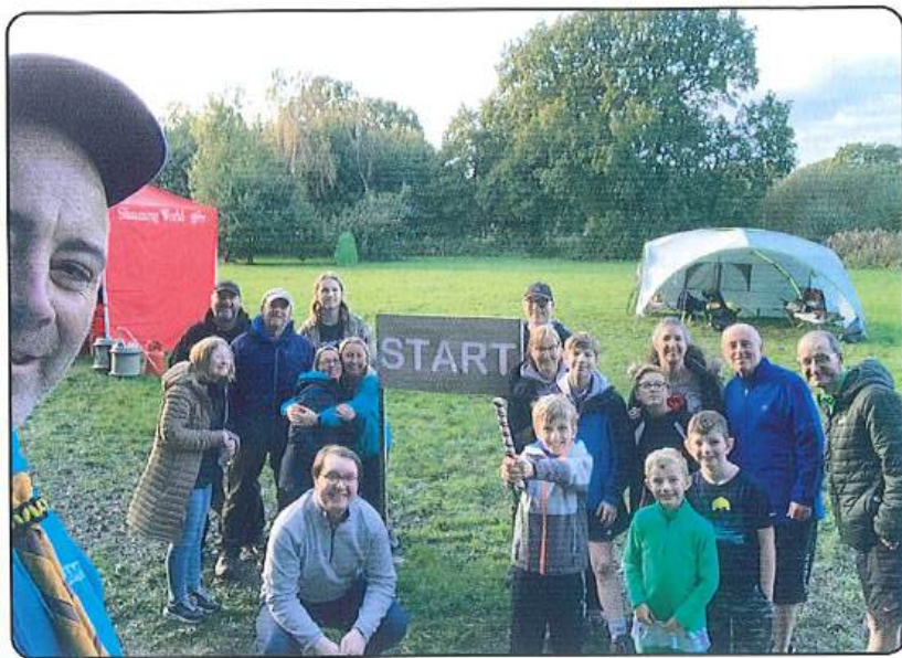
This photo is just minutes after we finished our last lap after 24 hours!

Thank you once again for giving us the opportunity to put our plan into action and equally as important, being able to do it within the community that we feel very much a part of.