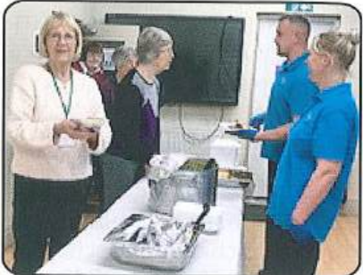
Style Catering serving hotpot lunch