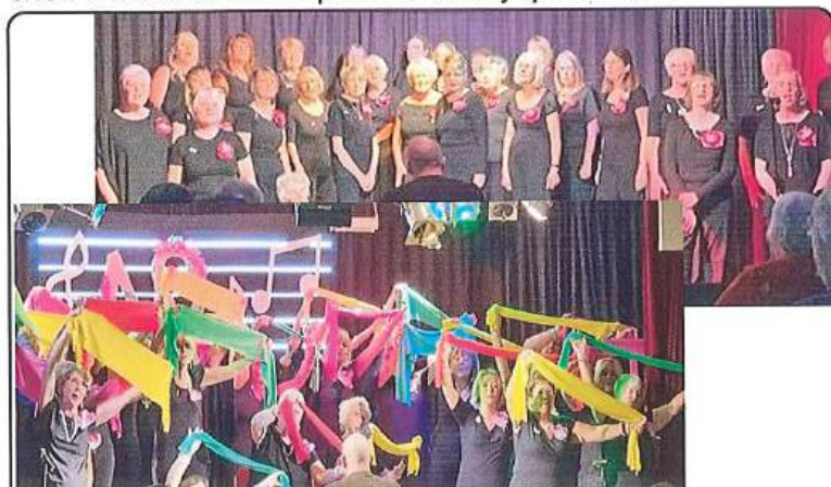
The Euxton Singers in concert. Why not join us?

The Euxton Singers are a ladies choir which meets in the Community Centre every Wednesday for practices. The choir's main aim is to promote the joy of music.