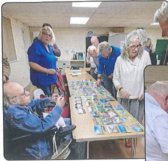
Photos of Councillors voting for their favourite photos to feature in the calendar

From the 12 photos, one for each month a first and two runners up were chosen as winners - but all the entries are winners as they feature in the calendar.